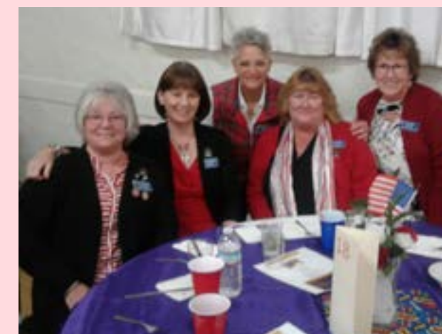
Board members at Orange Post dinner for new National American Legion Commander