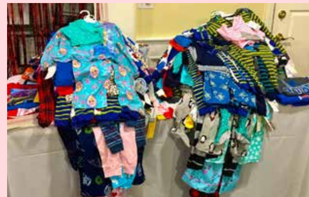
Fuzzy Wuzzy donations for Operation Pajama