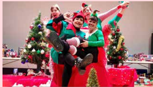
Newport Harbor Elves at VA Hospital Operation Santa