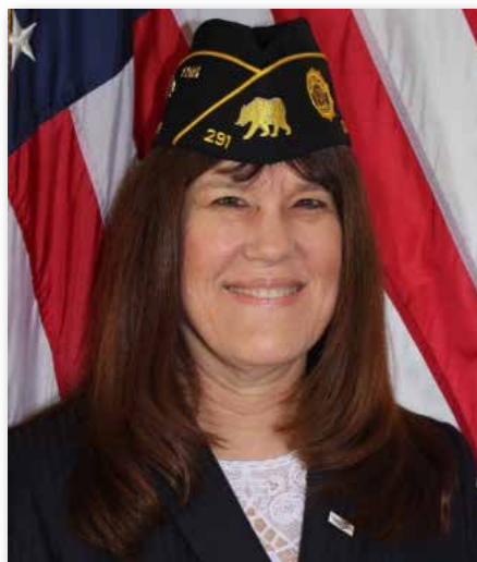
Greetings Post #291 Legion Family

We are starting the new year recruiting for our "Children and Youth Programs", which is one of the four pillars of the American Legion. Our first program held is the annual Oratorical Contest to be held on January 16th at 6:00 p.m. This competition is open to all high school ages freshman to Senior and consists of delivering a 8-10 minute memorized speech about the US Constitution and how it