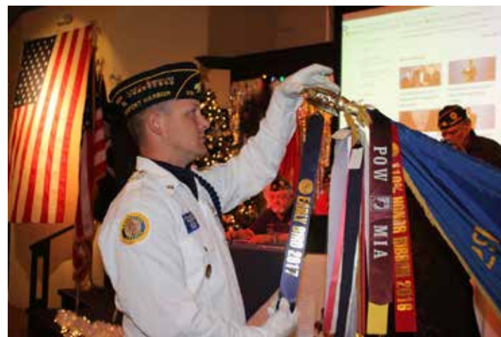
2017 Membership Achievement Award at January's General Meeting.