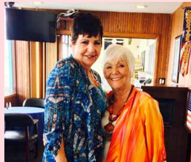
Gorgeous models at the Annual Fashion Show to benefit children with respiratory disease