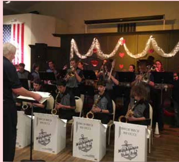
Newport Harbor High School Jazz Band at Sweethearts Ball