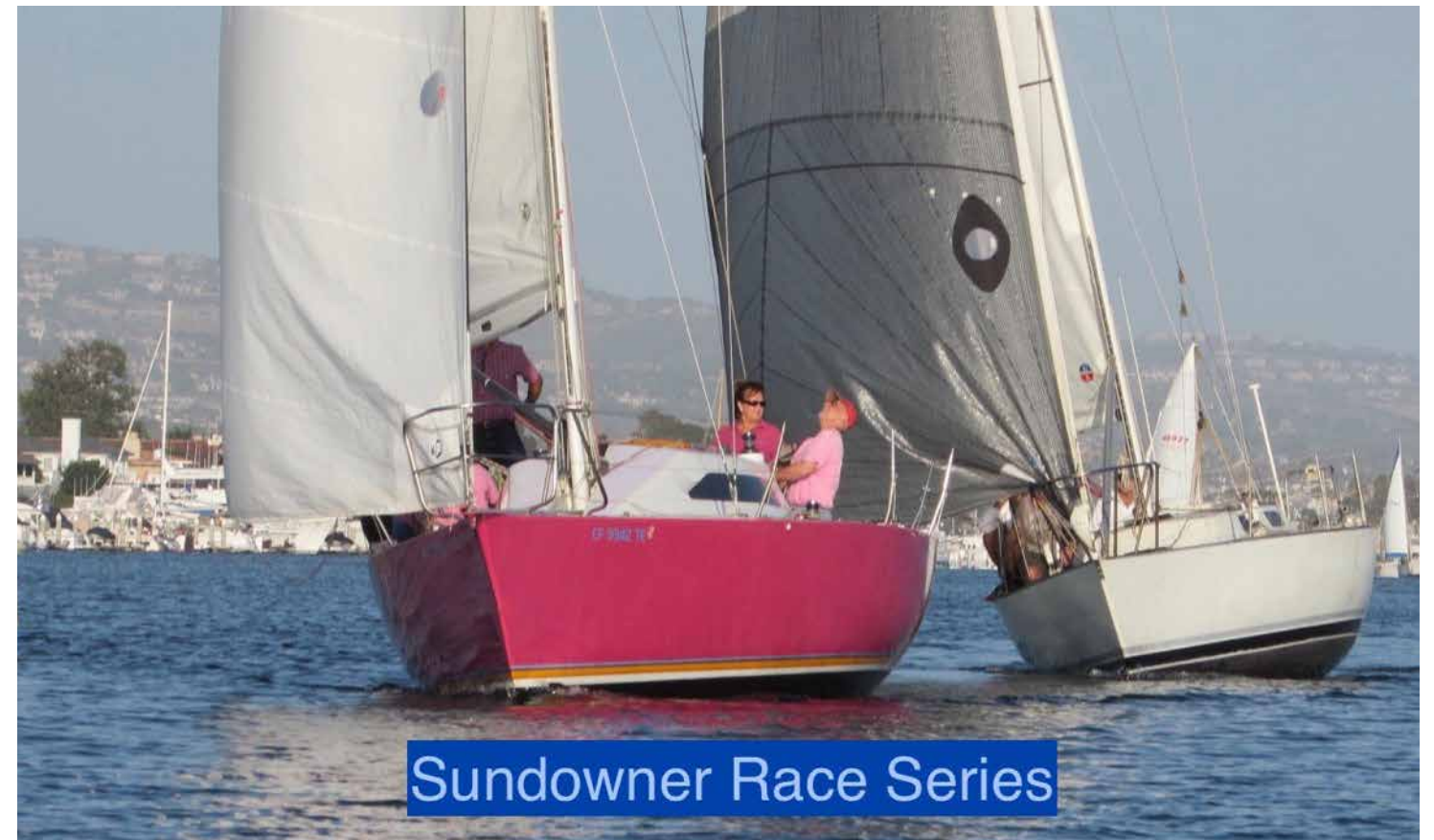
Sundowner Race Series