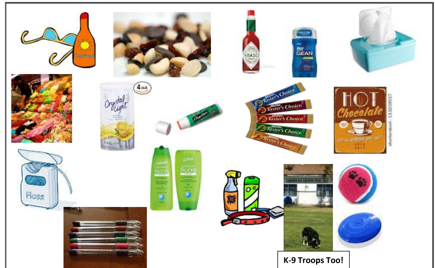
K-9 Troops Too!

AMERICAN LEGION AUXILIARY UNIT 291 TROOP & K9 SHIPPING SAT., JUNE 24 TH AT 10:00 AM PLEASE CHECK OUR WEBSITE WWW.ALA291.COM FOR A COMPLETE LIST OF ITEMS