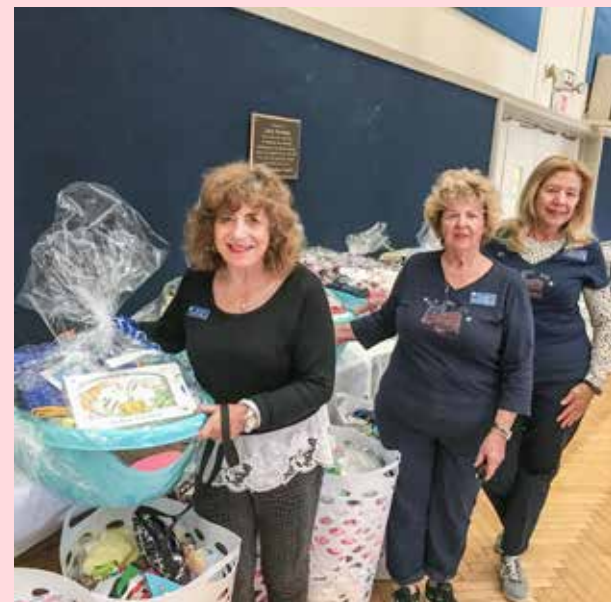
Baby bathtubs filled with goodies for our Veteran Moms-to-be!