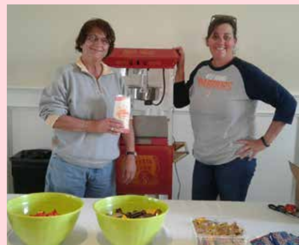
Popcorn & Candy at Movie Night