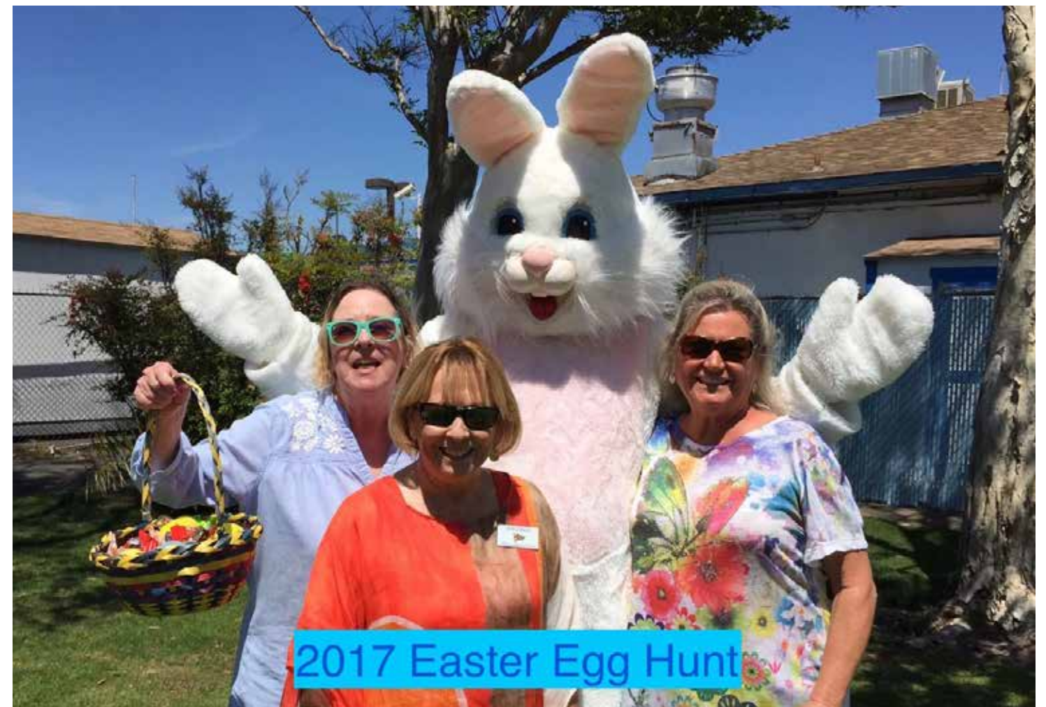
2017 Easter Egg Hunt