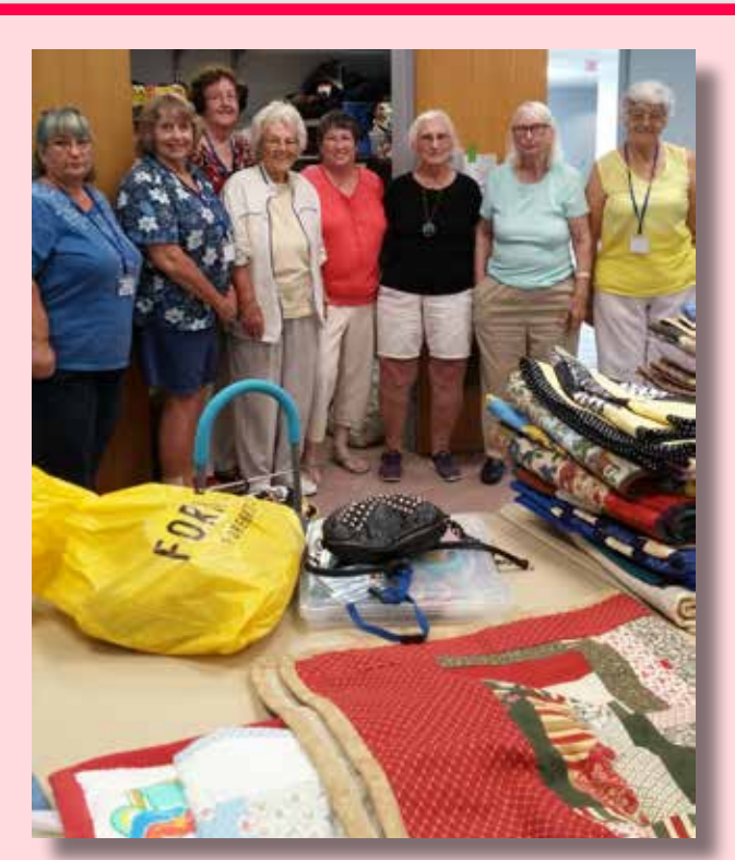
Costa Mesa Quilt Group present more than 70 handmade quilts for baby showers and VA patients!