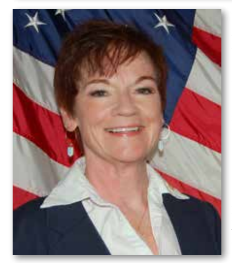
Our members showed up in force to serve our WWII and Korean War Vets lunch at the Post. It is the privilege of the Auxiliary to get to know these wonderful folks. Hope they enjoyed it as much as we did.

Currently looking for donations of back-to-school, fun and/or useful, items for upcoming deployment events for kids with parents going overseas. Our Children & Youth box is right next to the Troop Shipping box in the View Room by the