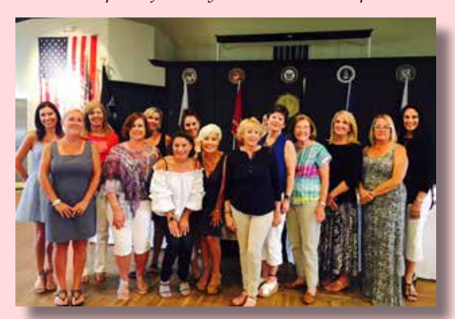
New Members July 2017!!