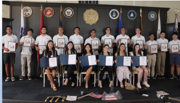
Boys & Girls State Post 291 Delegation August 29, 2021