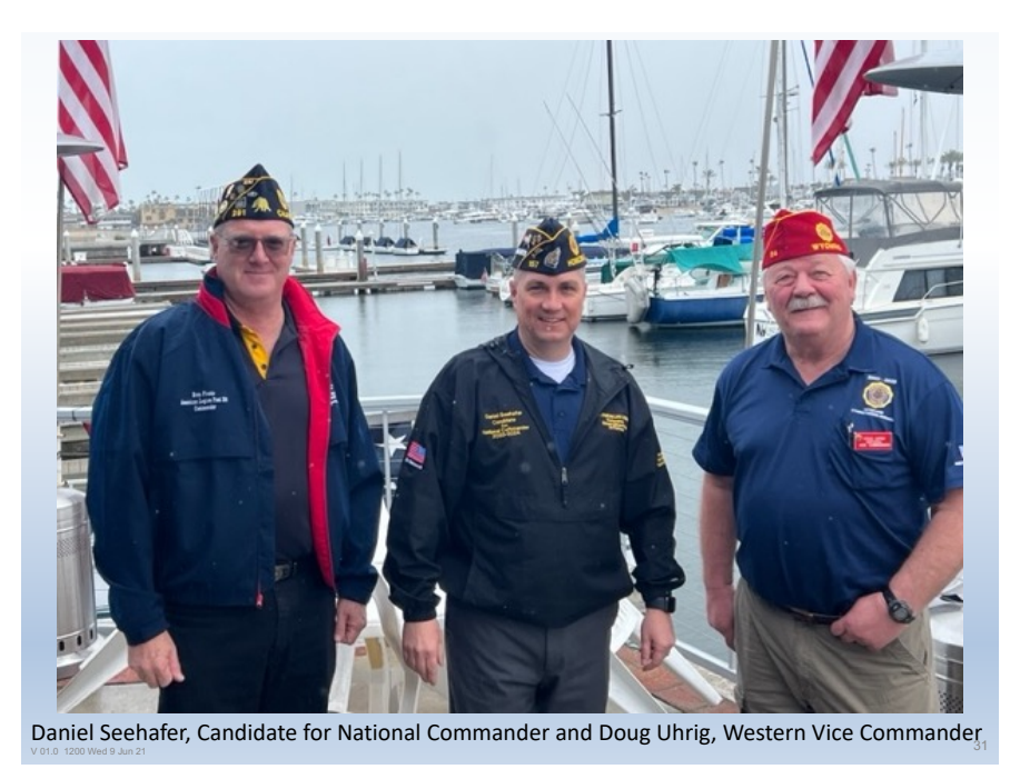
January 14 visit